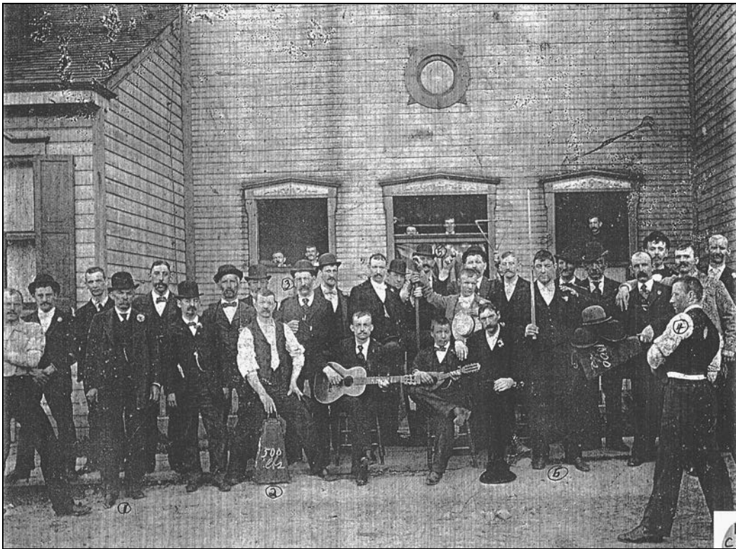
CITYVIEW HUNTING & FISHING CLUB, SOUTH SIDE AVENUE - 1900