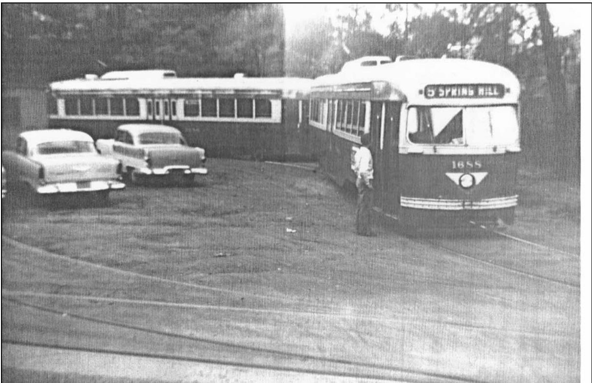
SPRING HILL TROLLEY LINE, RHINE STREET LOOP - 1957