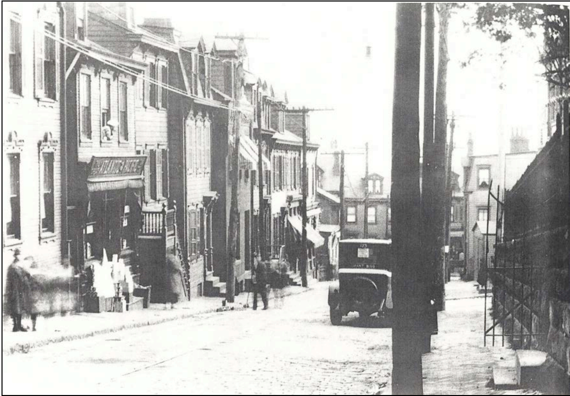
RHINE STREET NEAR HASLAGE AVENUE - 1925