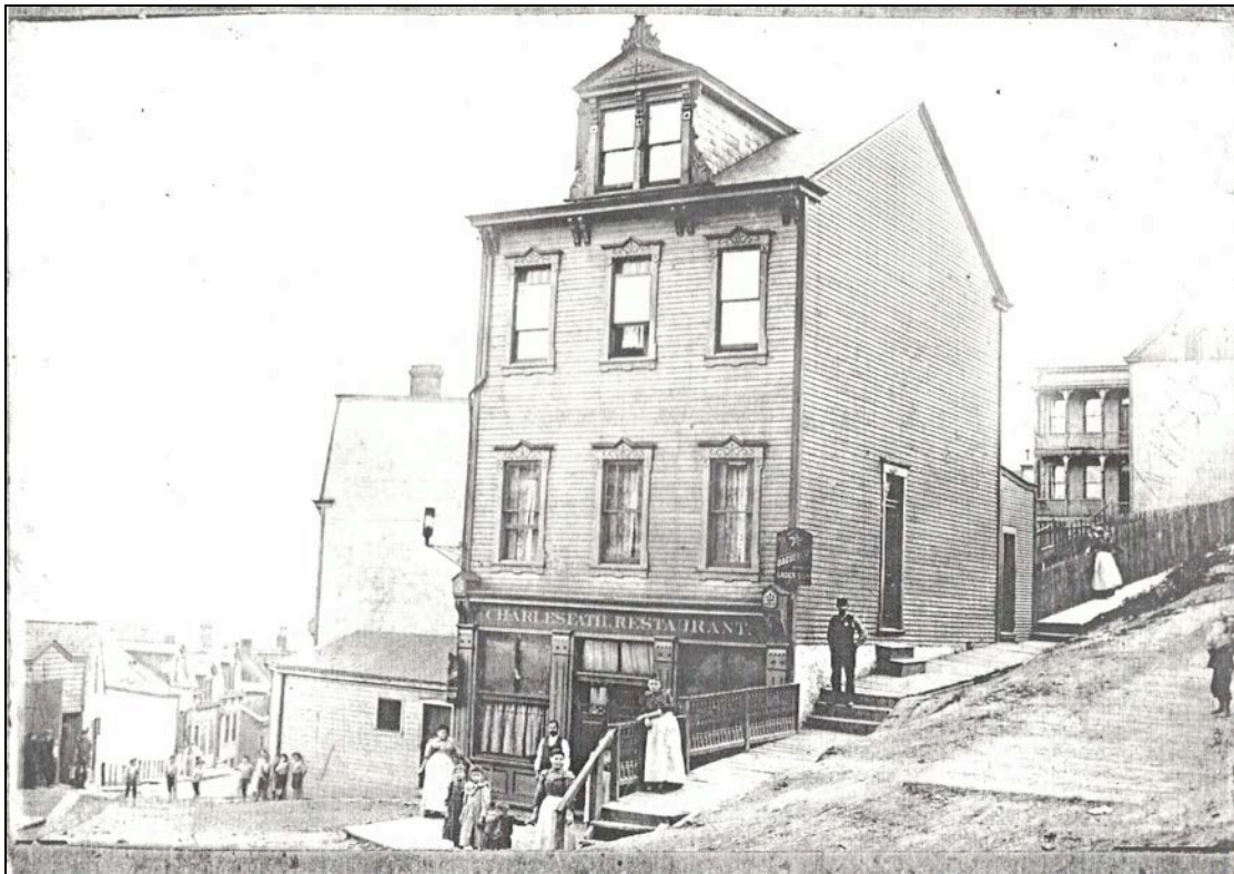
LUELLA STREET NEAR MINA STREET - 1898