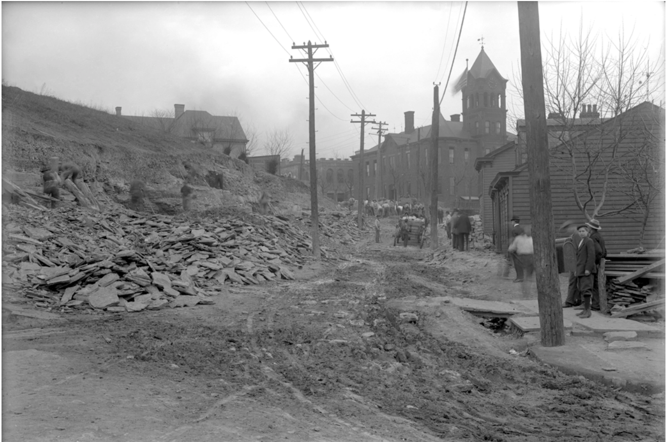
The above picture shows the conditions of how Damas Street looked on April 12, 1912. Notice how narrow the street was at the time.