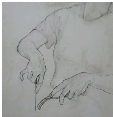
Self Portrait "Looking Back"