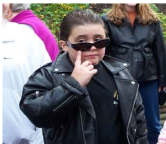
A Visit from the Terminator!