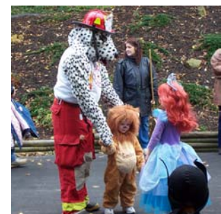
Sparky & Friends!