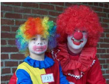
Happy & Sad Clowns