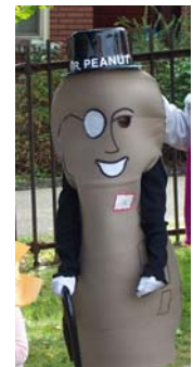
Planter Peanut even came!