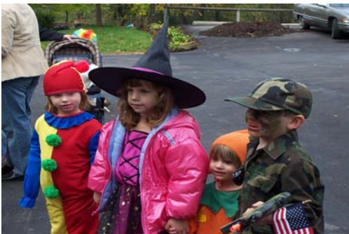
Lining up for the Parade!