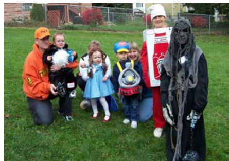
Costume Contest Winners